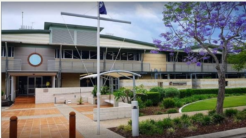
History Queensland - Annual General Meeting