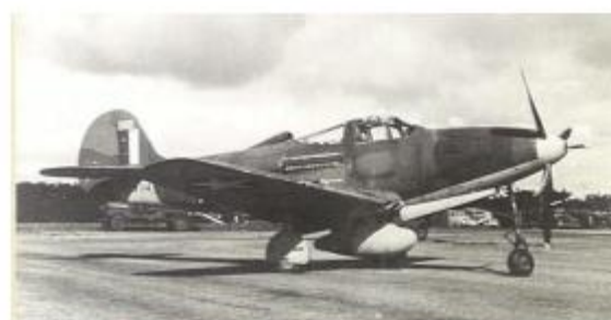
An Airacobra similar to those that crashed

The ill-fated flights were part of a training exercise conducted by the United States military during the early stages of World War II. The crashes claimed the lives of a pilot and co-pilot, casting a sombre shadow on the already tumultuous period. It is believed that weather conditions and mechanical failure were factors which may have contributed to the tragic events.