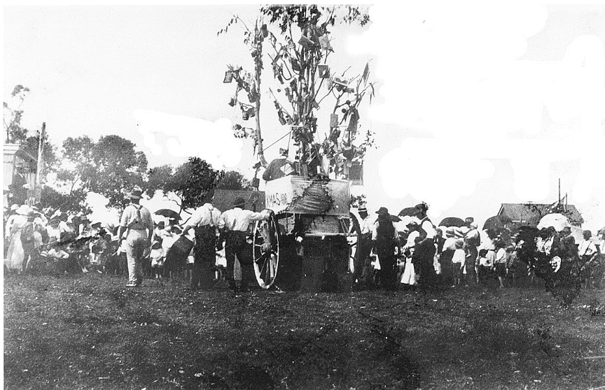
Christmas tree on cart, Cribb Island, early 1900's.

History Queensland will provide further details as they come to hand.